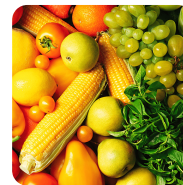
Ready Steady Grow